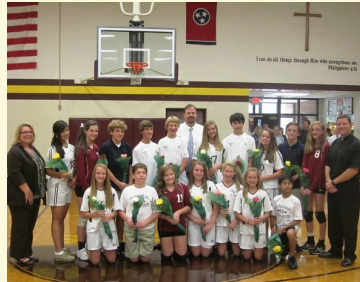
8th Grade Fall Sports athletes representing Cross Country, Tennis and Volleyball were recognized during the the SHCS/Webb volleyball game on September 28.