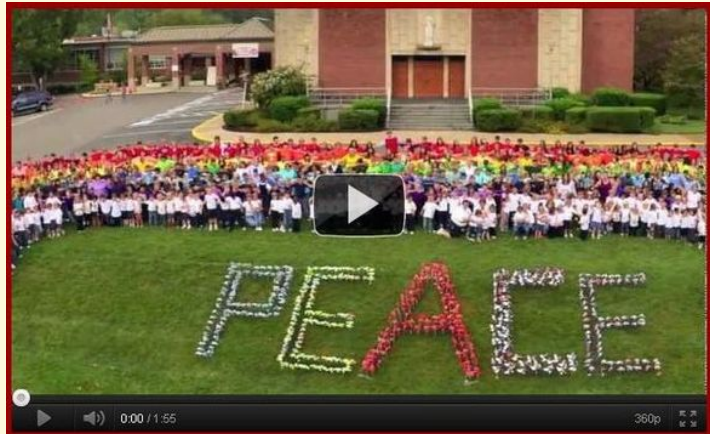
Click above for a slideshow of the Pinwheels for Peace project, September 21, 2011.