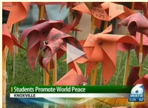
Click above to see WATE-TV's feature story on "Pinwheels for Peace" at Sacred Heart Cathedral School in Knoxville, Tennessee on September 21, 2011 in honor of International Day of Peace.

Not only did SHCS students create pinwheels with messages of peace, they also wrote essays about what peace means to them and about being peace-builders in their relationships.