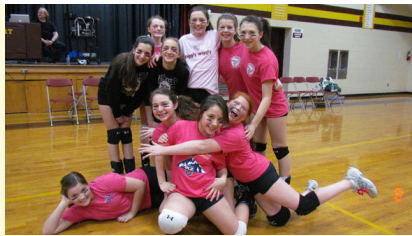
The middle school girls volleyball team beat the faculty team.